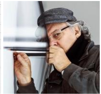
LEFT: Marco Maggi, GLOBAL MYOPIA (paper & pencil), 2015 detail. Self-adhesive archival paper and ERCO LED lighting. Uruguayan Pavilion, Giardini della Biennale, Venice, Italy. © Marco Maggi. Image courtesy of the artist and Ugo Carmeni. RIGHT: Marco Maggi.

In today's frenetically-paced and high-tech world, Marco Maggi returns to the original digital: that of the human hand and its fingers (also called digits). His artworks require viewers to slow down and look closely. Maggi makes precise, miniscule impressions and incisions in paper and paper-like surfaces, such as self-adhesive labels, aluminum foil, and the skin of Macintosh apples. In the Nasher gallery, Maggi has cut and adhered miniscule paper shapes directly to the walls. Viewers must look closely to appreciate the delicate lines and shapes that don't quite lay flat against the wall, creating lines and forms between the cut shapes and their shadows. Despite the intimate scale of Maggi's paper components, the viewer must also step back to realize the full breadth of his works as they extend along the wall onto adjoining walls and the ceiling. The tiny individual elements set within a broad expanse of space make it impossible to fully comprehend the works while standing in a single spot.