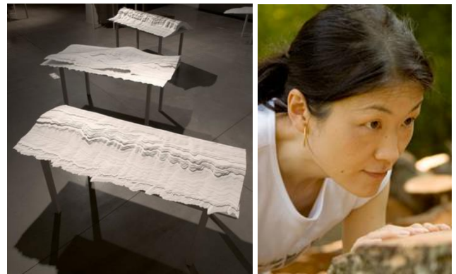
LEFT: Noriko Ambe, Inner Water 2012, 2012. cut paper Installation detail with cut paper sculptures. Wave 2 , Wave 3 , and Wave 4 . The Warehouse Gallery, Syracuse University, New York. © Noriko Ambe. RIGHT: Noriko Ambe.

Noriko Ambe originally trained as a painter, but stopped painting once she realized that the medium could never adequately fulfill her desire to express "infinite space." Several years later, the beautiful sight of white clouds in a blue sky from an airplane window made Ambe want to "melt into the natural world." She worked towards this concept by drawing one line after another on paper. Upon seeing a thick sketchbook in an art supply store, Ambe started cutting the organic, curving lines she had been drawing on the sketchbook's blank pages. Ambe committed herself to exploring this process for a decade, and has now made these works for 18 years. She makes all cuts by hand with a utility blade, beginning with a tiny incision on the first page that is used as a guide for the next page, with the cut on each following page growing slightly bigger. She made Wave 1 and Wave 4 after spending time on Long Island beach and in Rikuzentakata, a town affected by the 2011 Japanese earthquake, tsunami, and subsequent Fukushima nuclear disaster. Cardboard tubes inserted underneath stacks of cut paper suggest a never-ending wave cycle or the shift of earth and water due to natural phenomena.