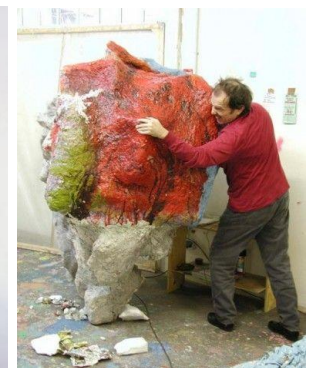
LEFT: Franz West, Sisyphos IX , 2002, 2002. Papier mâché, styrofoam, cardboard, lacquer, and acrylic. 68 ½ x 59 ¾ x 44 in. (174 x 151.8 x 111.8 cm). The Rachofsky Collection. © 2017 Estate of Franz West. © Archiv Franz West. RIGHT: Franz West in the studio.