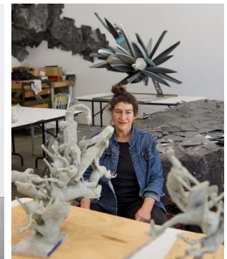
LEFT: Nancy Rubins, Drawing , 2010. Graphite pencil on paper, 134 x 379 x 12 in. (340 x 963 x 30 cm). © Nancy Rubins. RIGHT: Nancy Rubins.

decided to build sculpture that came from these drawings. The drawings themselves became experiments: Rubins completely covers large sheets of thick watercolor paper with dense, opaque layers of graphite scribbles and gestures made with flat-sided carpenter pencils sharpened to a broad, chisel-like edge. The layers of graphite produce a silvery sheen that transforms the flatness of the paper. An early example was draped over a sawhorse; another over a rope. In Drawing (2012), Rubins joins together drawings and mounts them on the wall, suggesting a rippling effect and the sense of simultaneous separation and coming together.