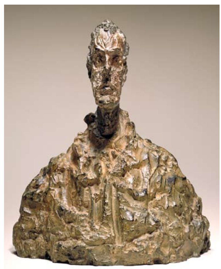
Alberto Giacometti, Bust of Diego (Buste de Diego) "Reproduction, including downloading of Arp, Brancusi, Braque, Calder, de Kooning, Dubuffet, Ernst, Giacometti, Gonzalez, Laurens, Maillol, Pevsner, Puni, Richier, Matisse, Miro, Picasso, Newman, Archipenko, Smith, Stella, Chamberlain, Serra and/or Shapiro works is prohibited by copyright laws and international conventions without the express written permission of Artists Rights Society (ARS), New York."