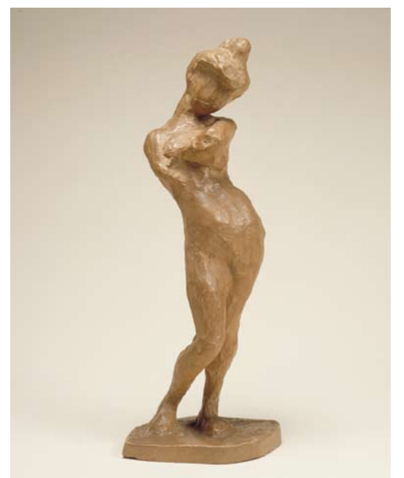
Henri Matisse, Madeleine I "Reproduction, including downloading of Arp, Brancus, Braque, Calder, de Kooning, Dubuffet, Ernst, Giacometti, Gonzalez, Laurens, Maillol, Pevaner, Puni, Richier, Matisse, Miro, Picasso, Newman, Archipenko, Smith, Stella, Chamberlain, Serara and/or Shapiro works is prohibited by copyright laws and international conventions without the express written permission of Artists Rights Society (ARS), New York."