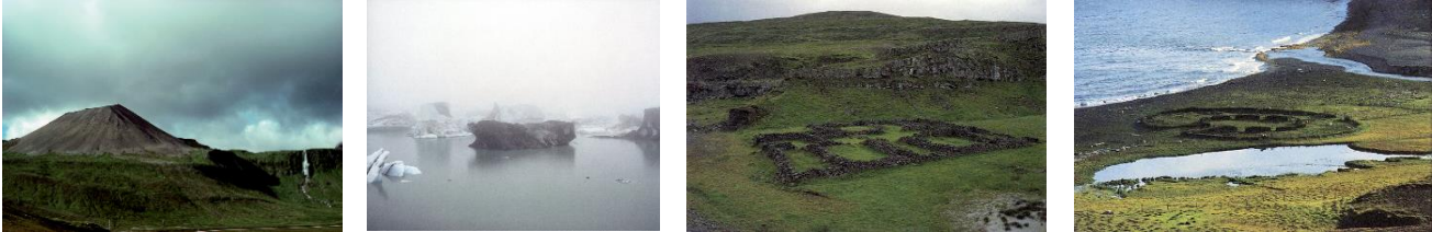
Roni Horn, from To Place, ongoing series. Collection of the artist.