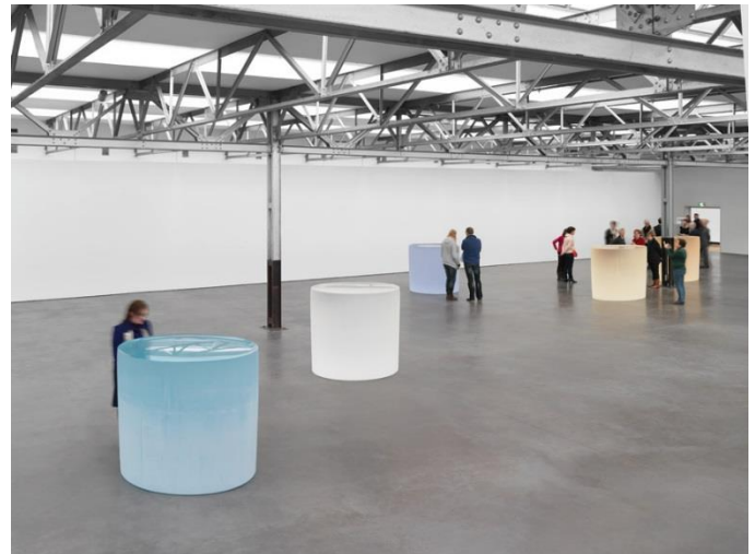
Roni Horn, Roni Horn Installation View

Exhibition view of Roni Horn at the DePont Museum, Tilburg, Netherlands, January 23-May 29, 2016.