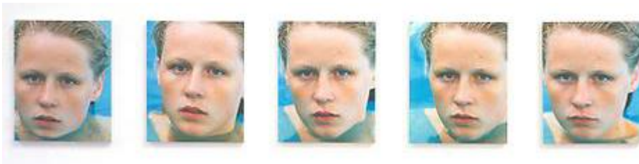
Roni Horn, You are the Weather , (detail), 1994-95, installation view, Matthew Marks Gallery, New York, 1996.