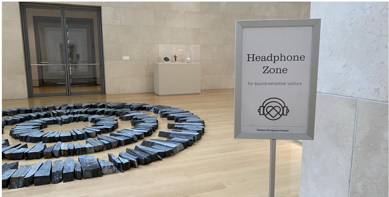
Headphone Zone sign

The museum has marked places that may be noisy with a sign that says Headphone Zone . When I see this sign, I can choose to wear the headphones from the Sensory Inclusive Kit. I can wear my own headphones if I brought them.