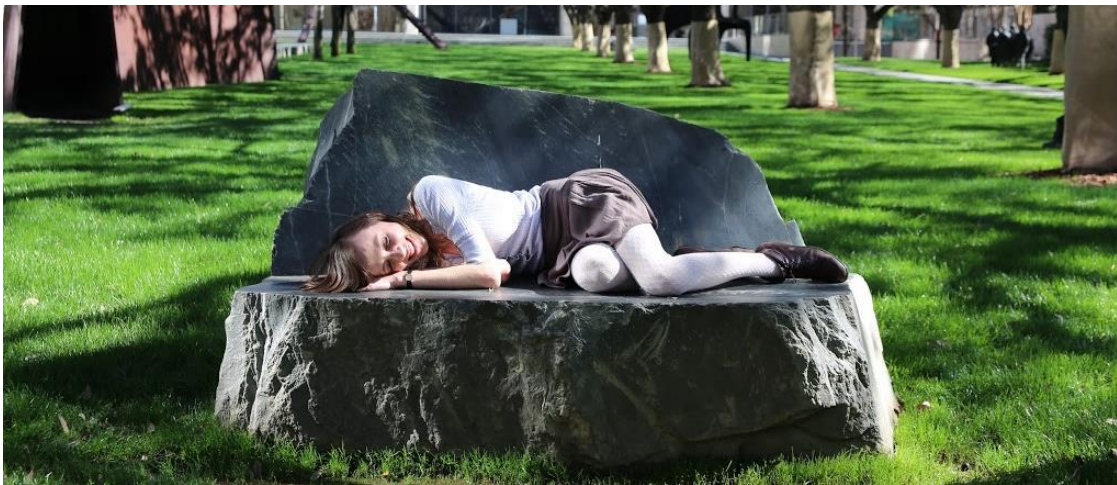
Schist Furniture Group

When I see Schist Furniture Group I can sit down or lay down!