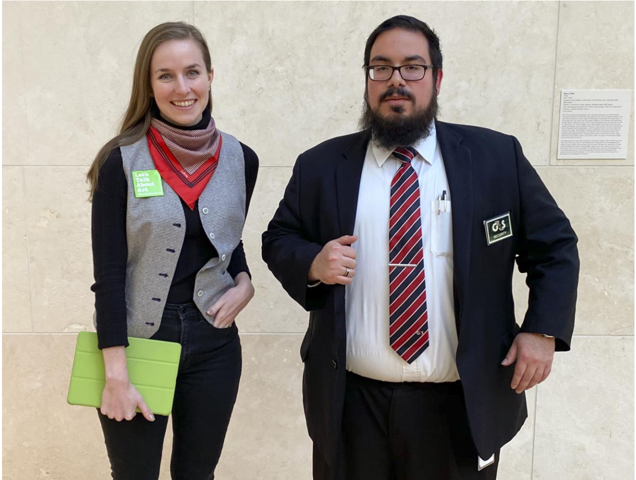
Visitor Experiences Facilitator and Security Guard

There will be Security Guards and Visitor Experiences Facilitators throughout the museum. They are here to help people and to keep the art safe.