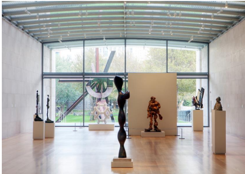
Nasher Sculpture Center Gallery

I am going to visit the Nasher Sculpture Center. I will see sculptures, drawings and paintings.