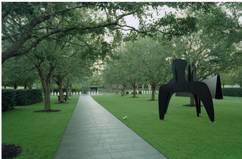
Nasher Sculpture Center Garden

Some of the sculptures are inside the building and others are outside in the garden.