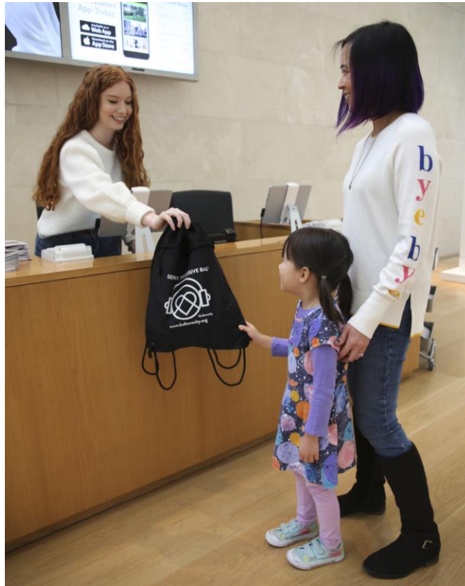
Checking out a Sensory Inclusive Kit

At the front desk, I can check out a Sensory Inclusive Kit. It includes headphones , a fidget , a feeling thermometer and a KCVIP lanyard for me to wear.