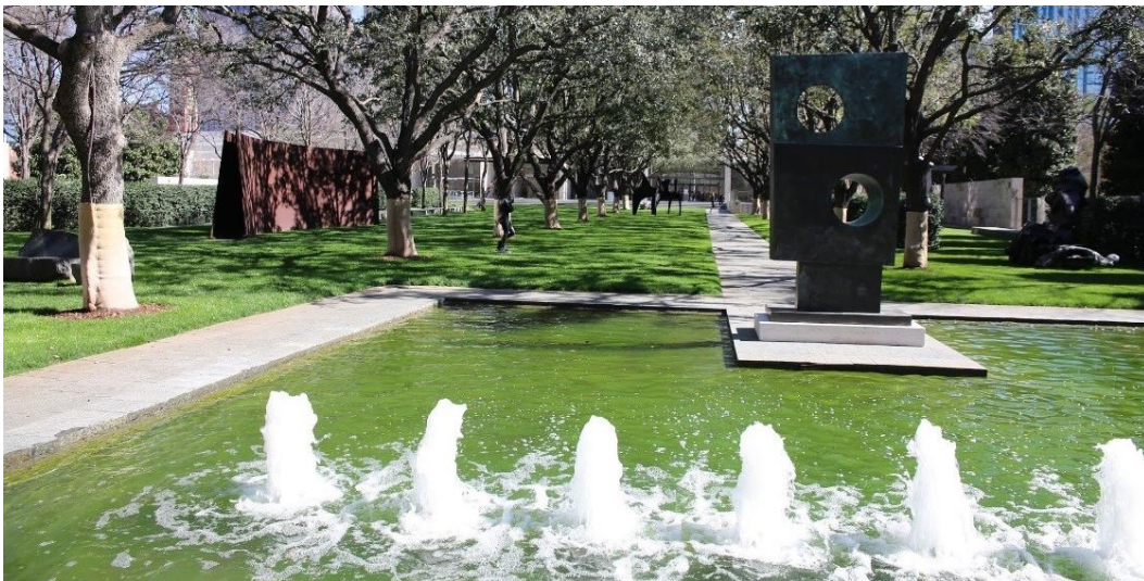
Fountains in Garden

It is OK to walk on the grass, but I will remember that I cannot touch, climb or lean on any of the sculptures or walls. I will also remember that the water in the fountains is to look at but not to touch or get into.