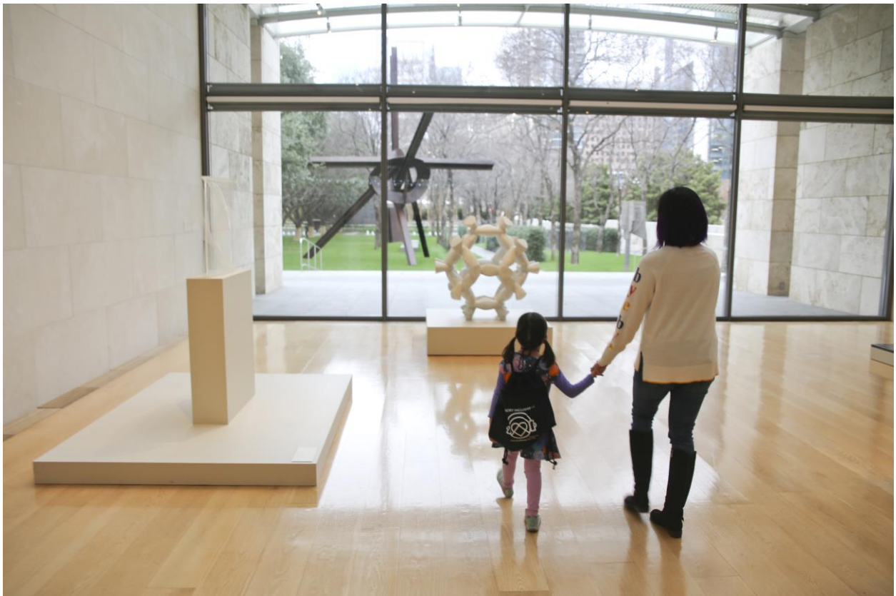
Keeping a safe distance from the art

When talking inside the building, I will use a quiet voice.