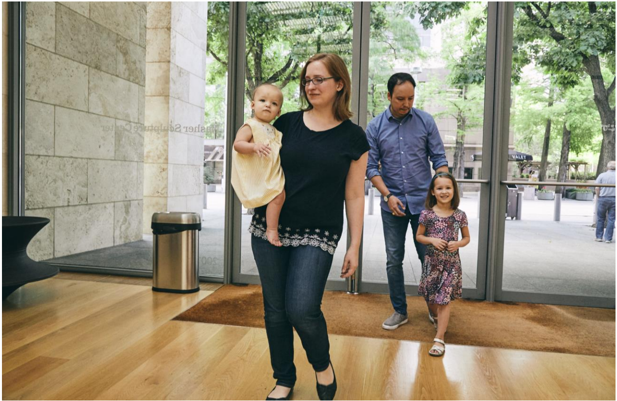
Nasher Sculpture Center Entrance

When I arrive, I will go through the large glass doors.