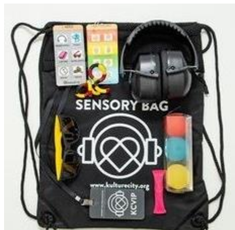
Sensory Inclusive Kit example

At the front desk, I can check out a Sensory Inclusive Kit. It includes headphones , a fidget , a feeling thermometer and a KCVIP lanyard for me to wear.