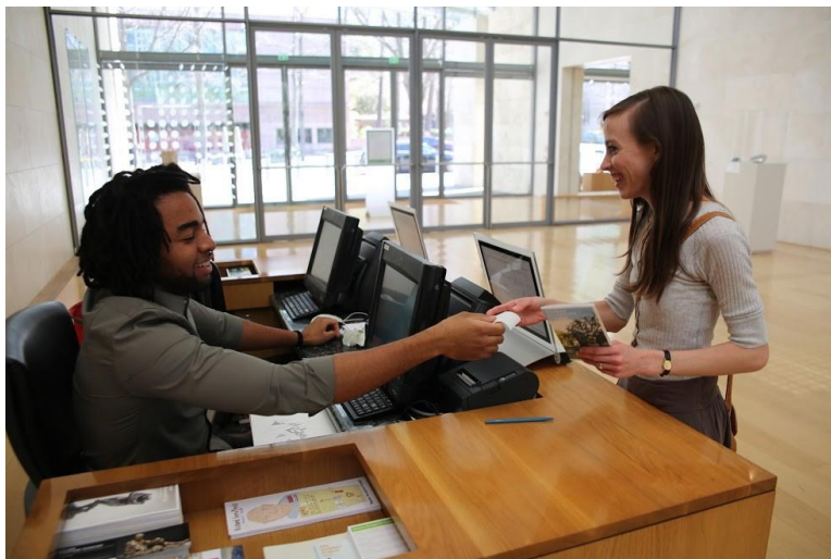
Purchasing a ticket