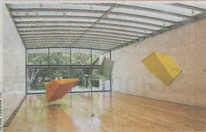
Above: Joel Shapiro’s ‘20 Elements’ (2004-05); left: Installation view of the exhibition at the Nasher Sculpture Center.

It’s hard to imagine these pieces having as much impact when they are removed from the site for which they were intended. That’s because they complement their space, and vice versa. The dimensions of the sublime gallery are 32 feet by 110 feet. Its height is 16 feet at the wall line, 17 at the apex