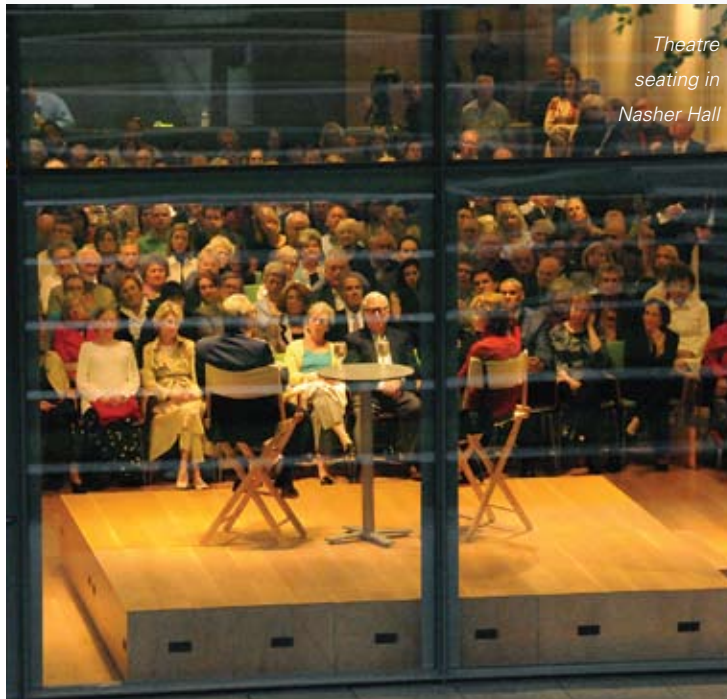
Theatre seating in Nasher Hall

“ We did it! The celebration Wednesday was a great success. Thank you so much. And please extend my appreciation to the men and woman in the back & front of the house who pulled it all together. ”