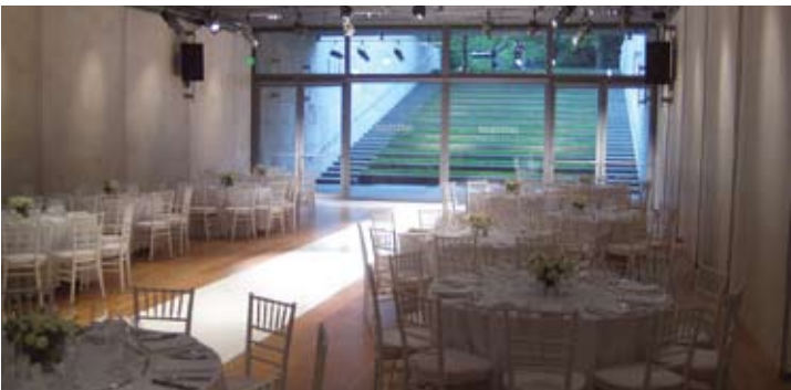
Nasher Hall 180 - Seated • 225 - Standing • 1,920 sq. ft.