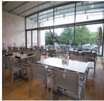
Nasher Cafe 60 - Seated • 150 - Standing • 896 sq. ft.