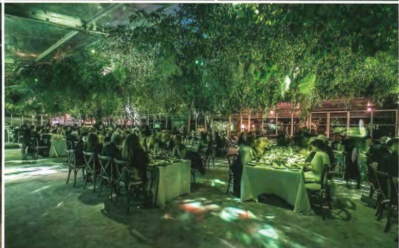
A canopy of greenery