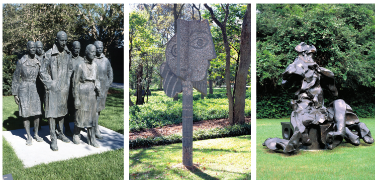
(Left) George Segal, Rush Hour , 1963 (cast 1985-86) Bronze, 73 x 74 x 67 in., (Center) Pablo Picasso, Head of a Woman (Tête de femme) , 1958 Gravel and concrete, 120 1/8 x 43 1/4 x 55 7/8 in., (Right) Willem de Kooning, Seated Woman , 1969 (cast 1980) Bronze, 113 x 147 x 94 in.