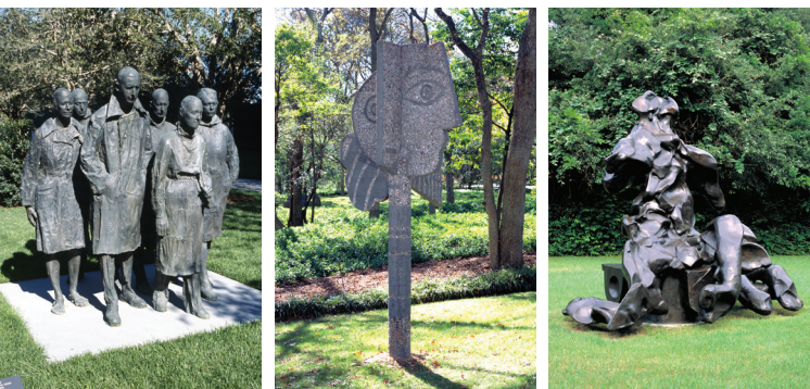
(Left) George Segal, Rush Hour , 1963 (cast 1985-86) Bronze, 73 x 74 x 67 in., (Center) Pablo Picasso, Head of a Woman (Tête de femme) , 1958 Gravel and concrete, 120 1/8 x 43 1/4 x 55 7/8 in., (Right) Willem de Kooning, Seated Woman , 1969 (cast 1980) Bronze, 113 x 147 x 94 in.